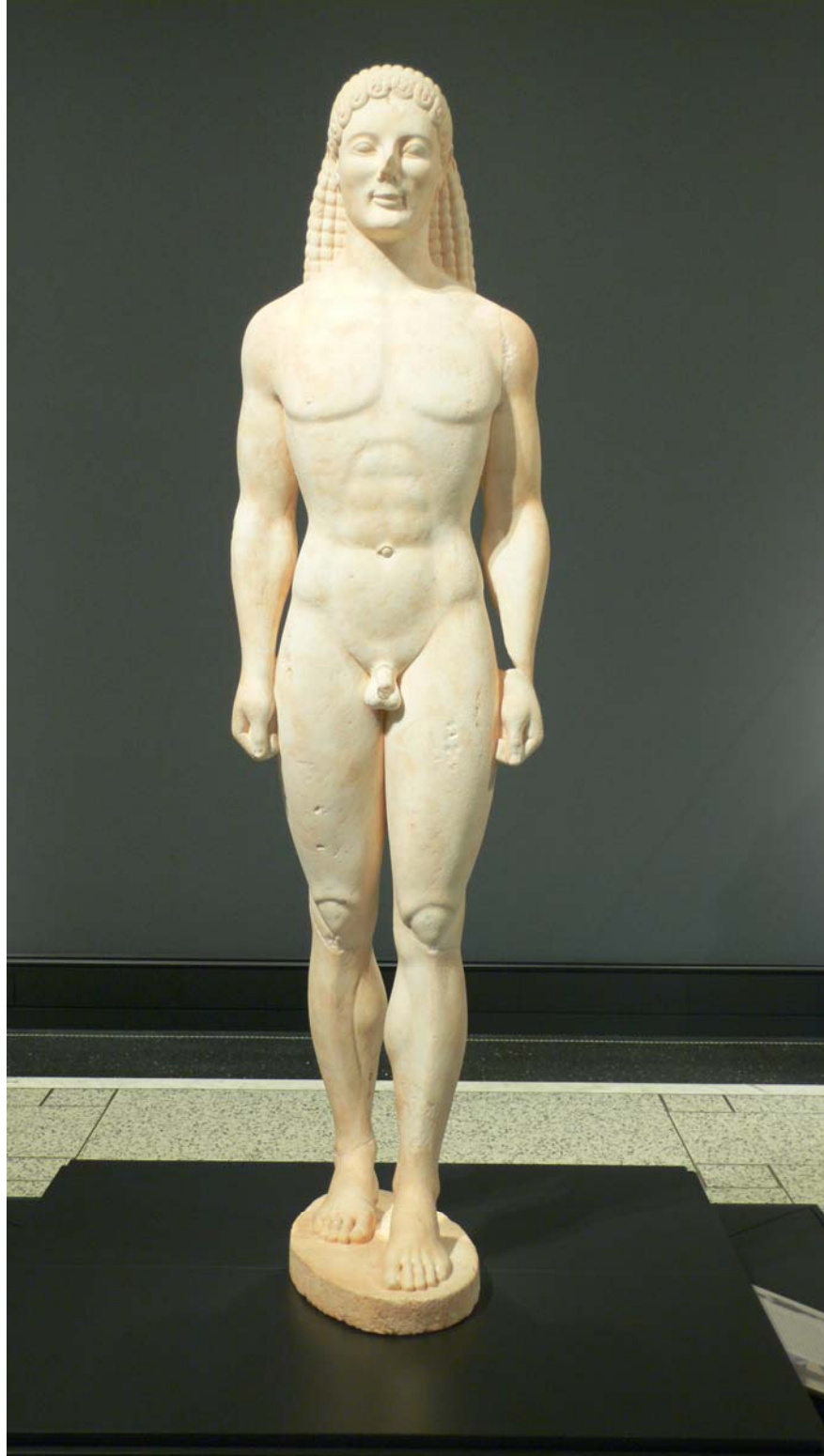
Fig. 2: Kouros, J. Paul Getty Museum.