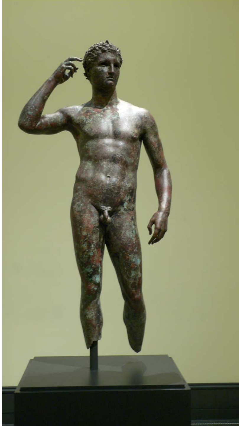
Fig. 1: Bronze statue, fourth century B.C., J. Paul Getty Museum.